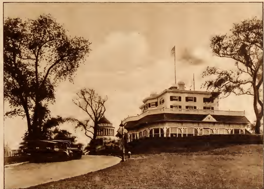
THE CLAREMONT, the popular restaurant of Riverside Drive.